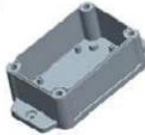
Hypotheca (1PCS) Material:ABS Color:Light Grey(FS20412)