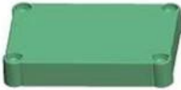
Epitheca (1PCS) Material:ABS Color:Light Grey(FS20412)