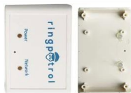
HOT MELT TREATMENT