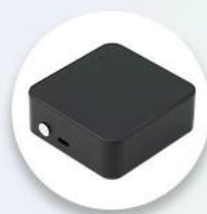
MOQ 1 PIECE