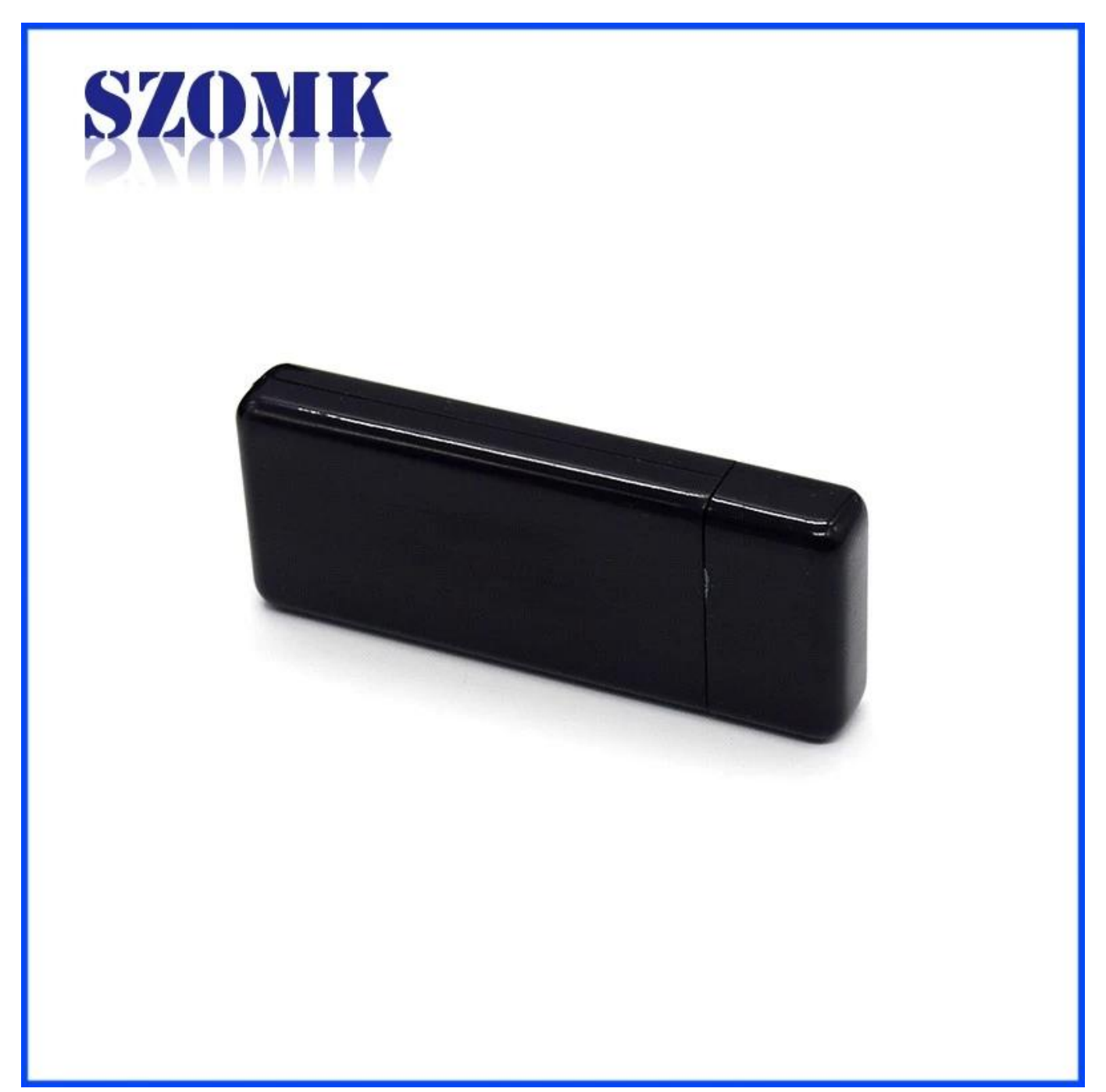
Shipped in 5 days after payment