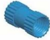
Copper Nut(6PCS) Material:Copper Standard:M4*10 Color:Copper