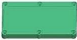
Epitheca (1PCS) Material:ABS Color:Light Grey(FS20412)