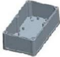
Hypotheca (1PCS) Material:ABS Color:Light Grey(FS20412)