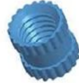
Copper Nut(4PCS) Material:M4*5 Color:Copper