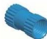
Copper Nut(4PCS) Material:Copper Standard:M4*10 Color:Copper