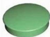
Screw Lid(6PCS) Material:ABS Color:Light Grey(FS20412)