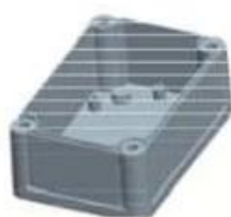
Hypotheca (1PCS) Material:ABS Color:Light Grey(FS20412)