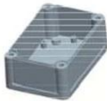
Hypotheca (1PCS) Material:ABS Color:Light Grey(FS20412)