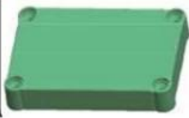
Epitheca (1PCS) Material:ABS Color:Light Grey(FS20412)