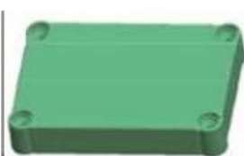
Epitheca (1PCS) Material:ABS Color:Light Grey(FS20412)