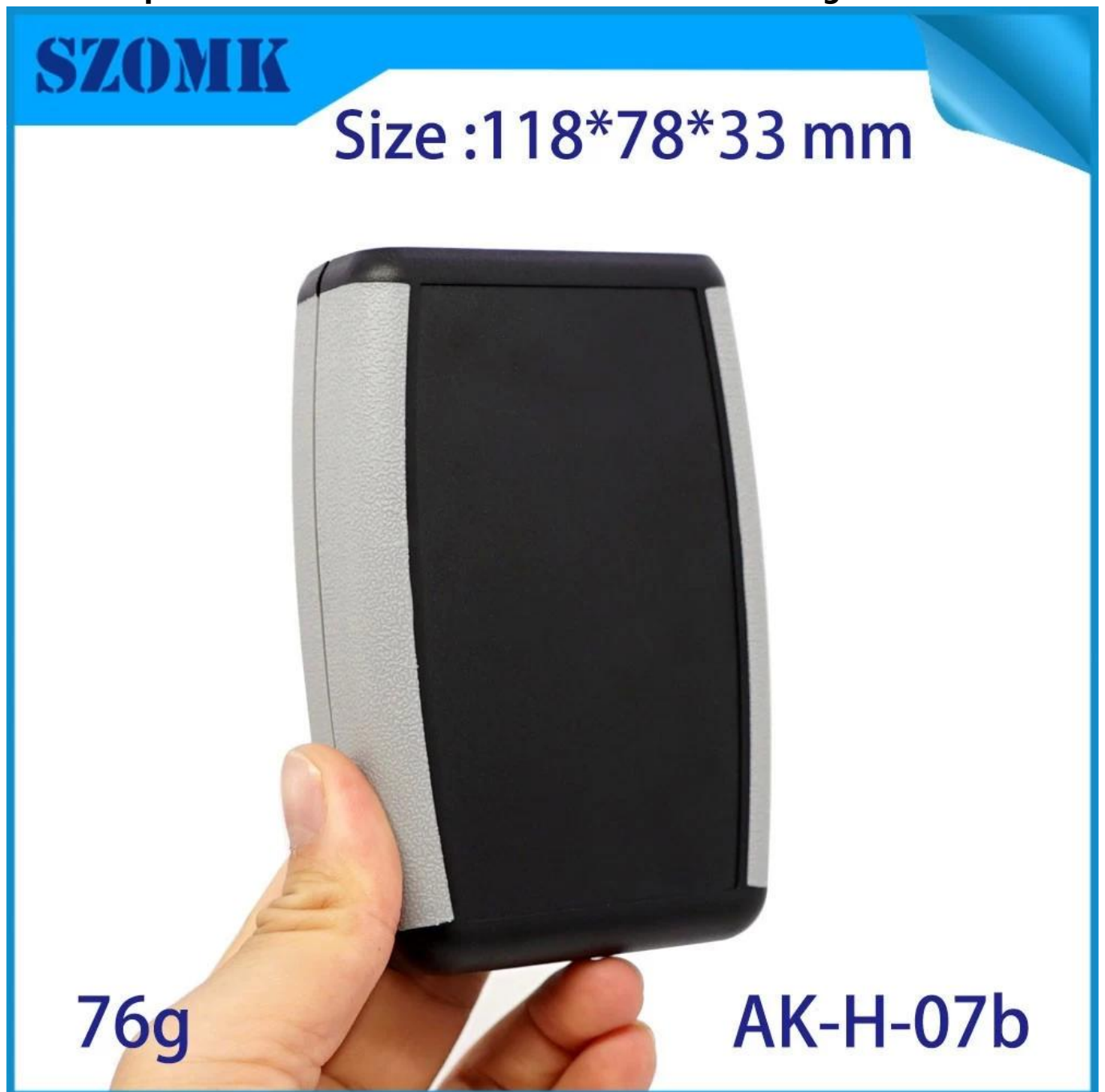
Detailed pictures of Plastic Handheld Enclosure Casing Box