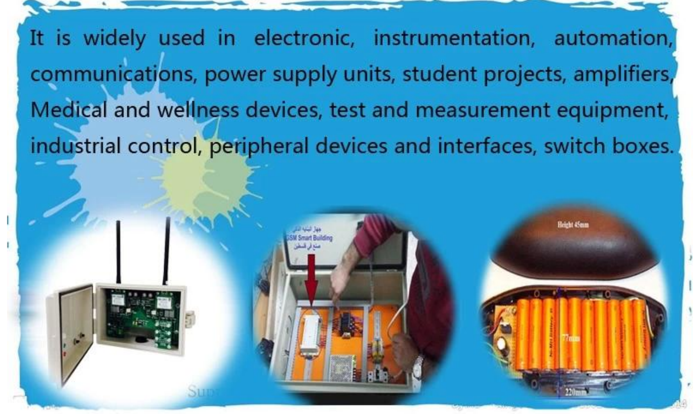
Advantages of the abs plastic electronics distribution box