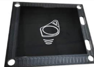
CUSTOM PC PLATE