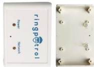
HOT MELT TREATMENT