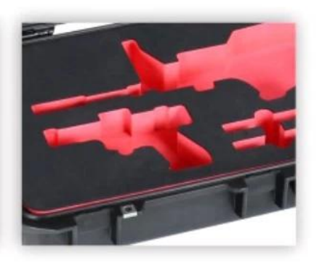
BOTTOM COVER SQUARE SPONGE