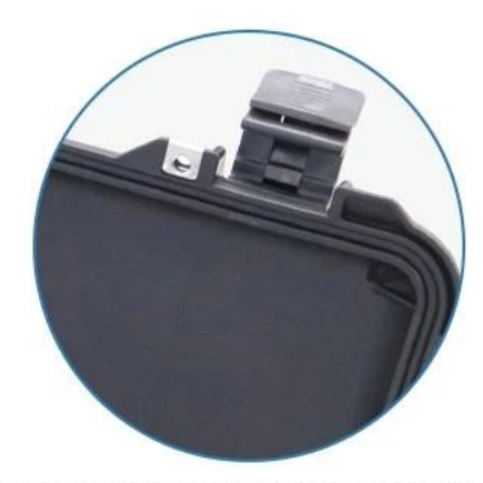
THE APPEARANCE IS NEW, STURDY, EASY TO OPERATE, AND SELF OPENING RESISTANT.