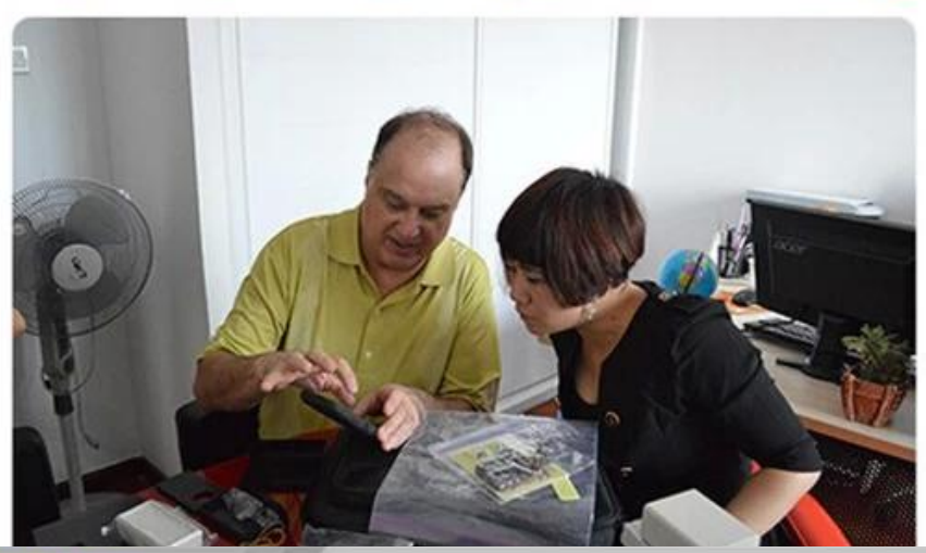
Faciory and biowroom