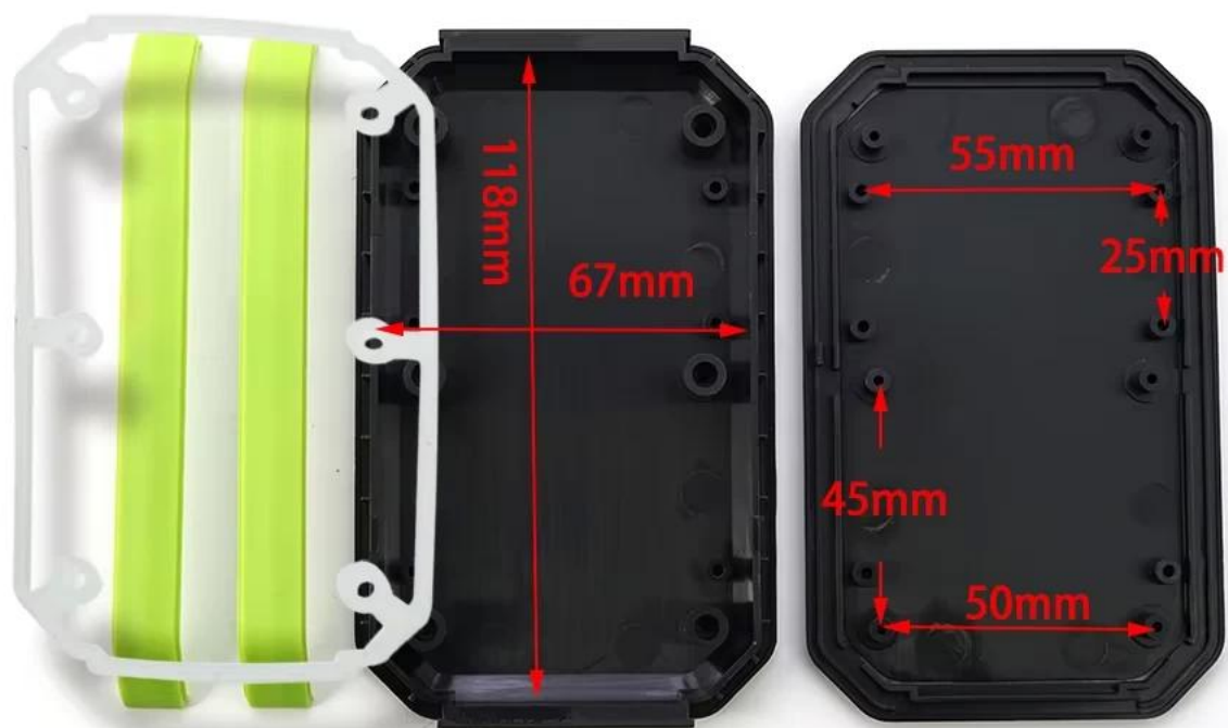
Internal PCB size