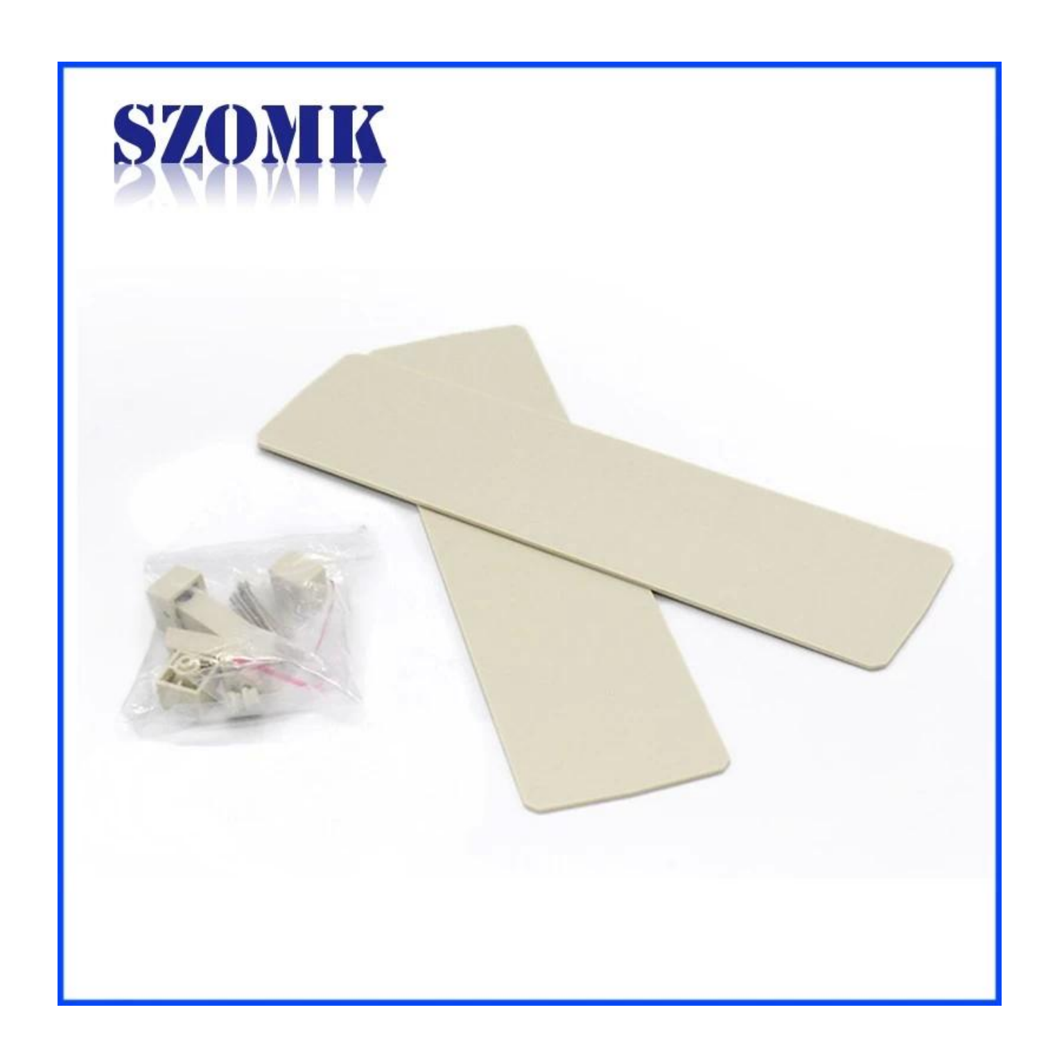
What can I do for you