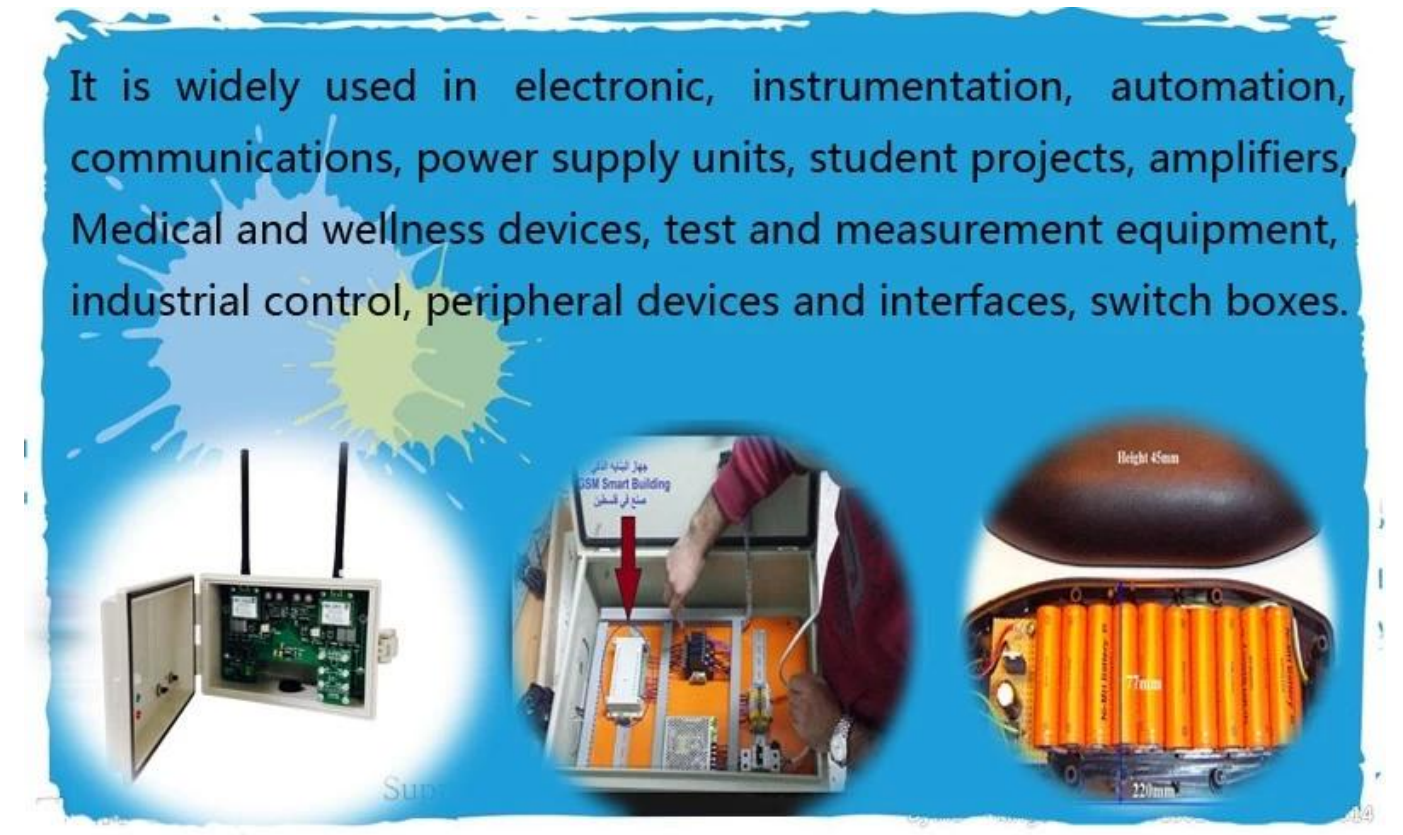
Advantages of plastic RFID access control enclosure