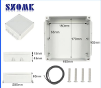
AK-01-54 205*177*60mm 380g