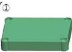
① Epitheca (1PCS) Material:ABS Color:Light Grey(FS20412)