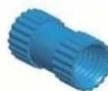
Copper Nut(6PCS) Material:Copper Standard:M4*10 Color:Copper