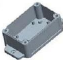
② Hypotheca (1PCS) Material:ABS Color:Light Grey(FS20412)