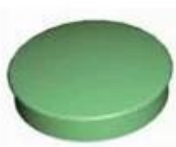
Screw Lid(6PCS) Material:ABS Color:Light Grey(FS20412)