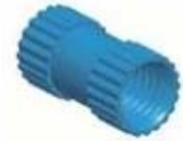
Copper Nut(6PCS) Material:Copper Standard:M4*10 Color:Copper