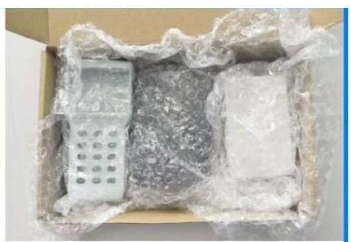
Metal shell packaging