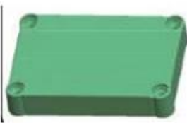
Epitheca (1PCS) Material:ABS Color:Light Grey(FS20412)