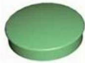
Screw Lid(6PCS) Material:ABS Color:Light Grey(FS20412)