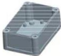
Hypotheca (1PCS) Material:ABS Color:Light Grey(FS20412)