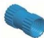
Copper Nut(6PCS) Material:Copper Standard:M4*10 Color:Copper