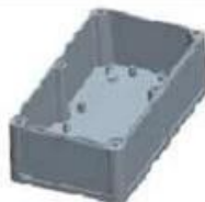
Hypotheca (1PCS) Material:ABS Color:Light Grey(FS20412)