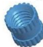
Copper Nut(4PCS) Material:M4*5 Color:Copper