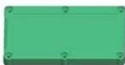
Epitheca (1PCS) Material:ABS Color:Light Grey(FS20412)