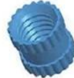
Copper Nut(4PCS) Material:M4*5 Color:Copper