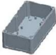
Hypotheca (1PCS) Material:ABS Color:Light Grey(FS20412)