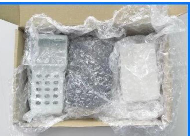
Metal shell packaging