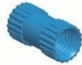
Copper Nut(6PCS) Material:Copper Standard:M4*10 Color:Copper